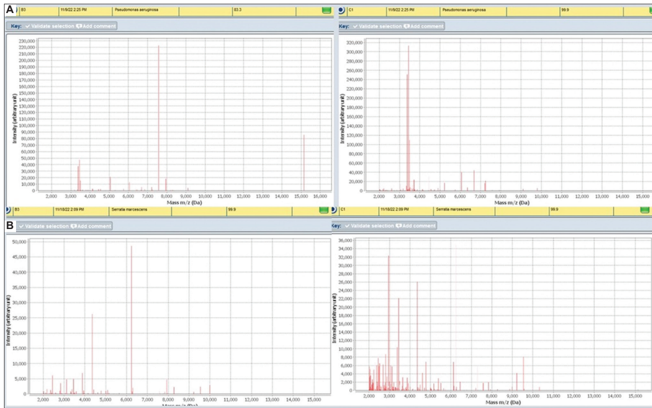
Figure 2. Mass-to-charge ratio (m/z) spectra from both methods. (A) Method 1 demonstrates m/z peaks around 6,000 – 8,000 Daltons, while (B) Method 2 presents m/z peaks around 2,000 – 3,000 Daltons